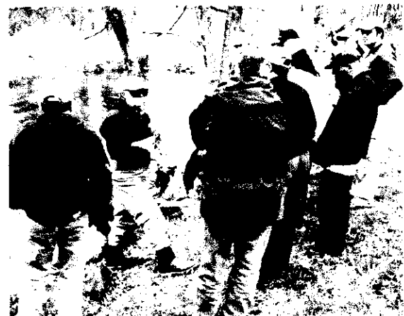
A Demo on Fun Day at Dakota