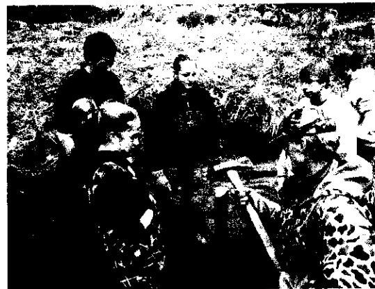
A Workday with Students from West High

During the year, we had some some great events! Here is a sampling of just two.