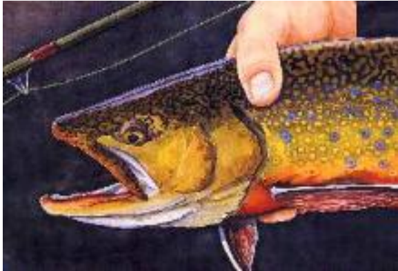
<<< Illustration "One Last Look - Brook Trout" courtesy of Bob White of Whitefish Studio